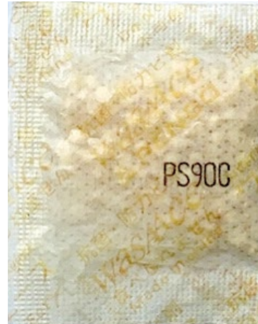
• Counterfeit Products

We have confirmed that counterfeits of WASAACE®, Rengo's anti-mold agent which we sell as an agent, have recently been marketed in China.