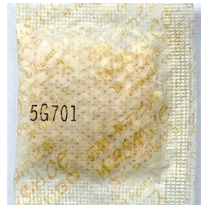
• Printed "5G701" on the back

※ We assume no responsibility for counterfeit products purchased by our customers and used them. We ask for their understanding of any defects or accidents.