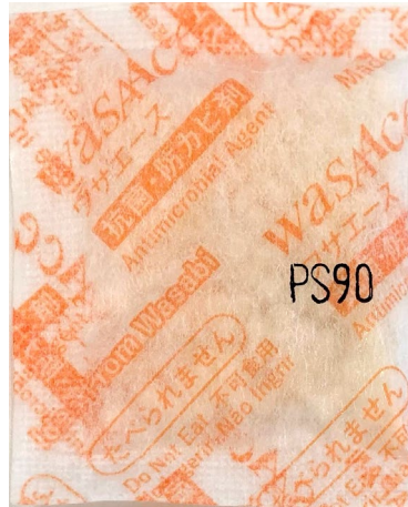
• Authentic Products (90-Day type)