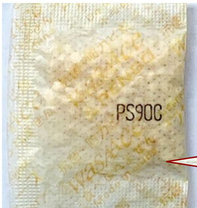
• Porous film is used in counterfeit product